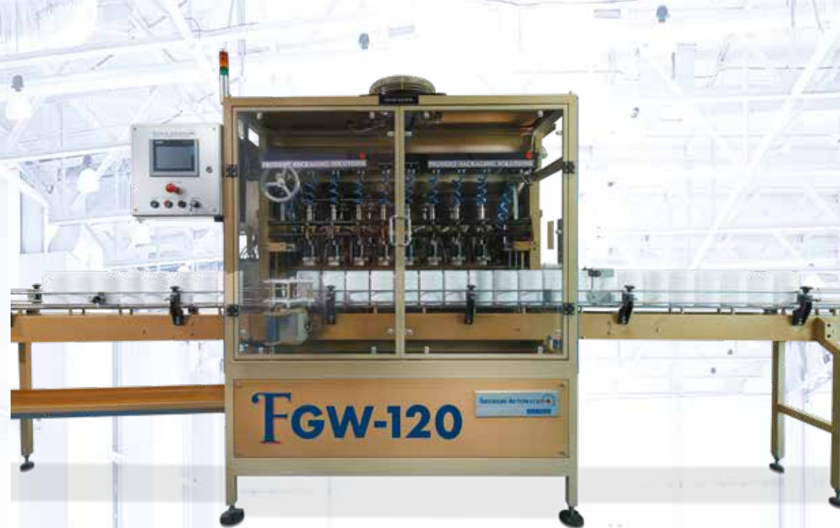
SHEMESH AUTOMATION'S FGW-120 FILLING MACHINE WITH COMPLETE EXPLOSION (EX) AND CORROSION PROTECTION