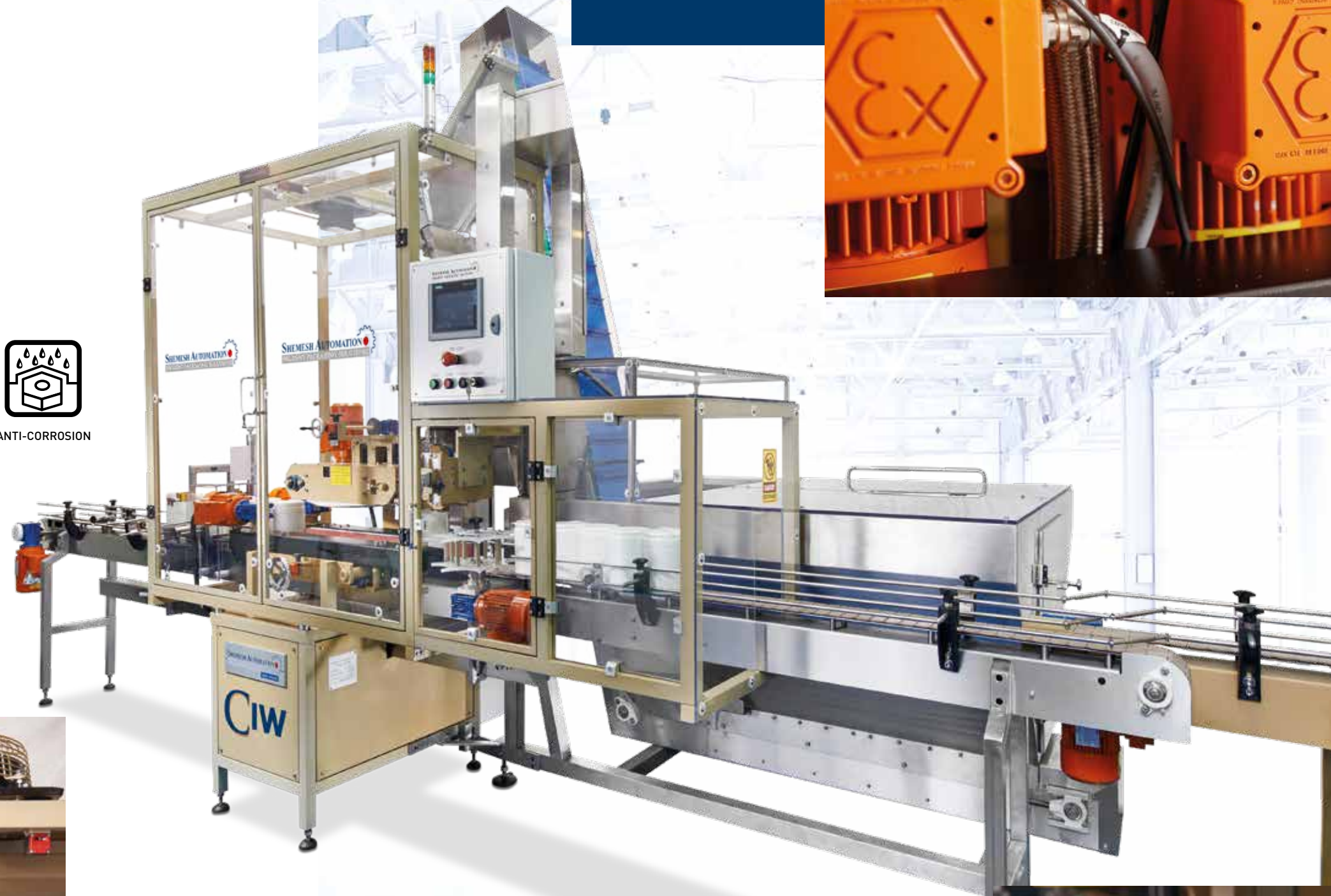
SHEMESH AUTOMATIONS' CIW120 SNAP-ON 120PPM CAPPING MACHINE, EXPLOSION PROOFED AND CORROSION PROOFED