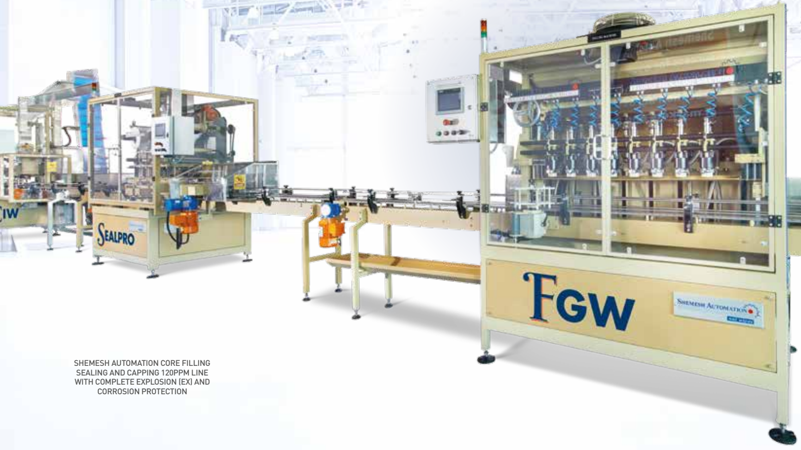
SHEMESH AUTOMATION CORE FILLING SEALING AND CAPPING 120PPM LINE WITH COMPLETE EXPLOSION (EX) AND CORROSION PROTECTION