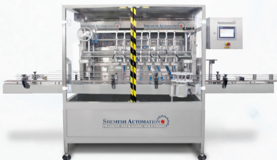
FGW120 Inline Liquid Filler and Doser