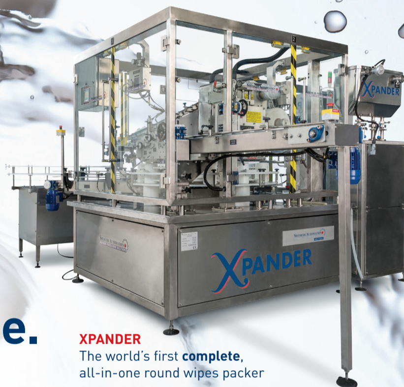
XPANDER The world's first complete , all-in-one round wipes packer