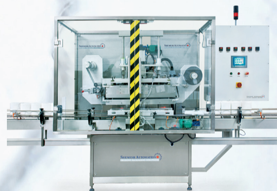
SEALPRO120 Inline Cut Foiler and Sealer

Market leader Shemesh Automation Wet Wipes is the world's only manufacturer to offer both complete inline and monoblock round wipes packaging solutions to meet any requirement. From single units to full turnkey applications, Shemesh is the name you can rely on for innovation that keeps you ahead of the competition.