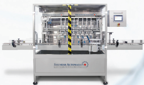
FGW120 Inline Liquid Filler and Doser