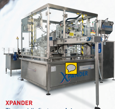
XPANDER The world's first complete , all-in-one round wipes packer