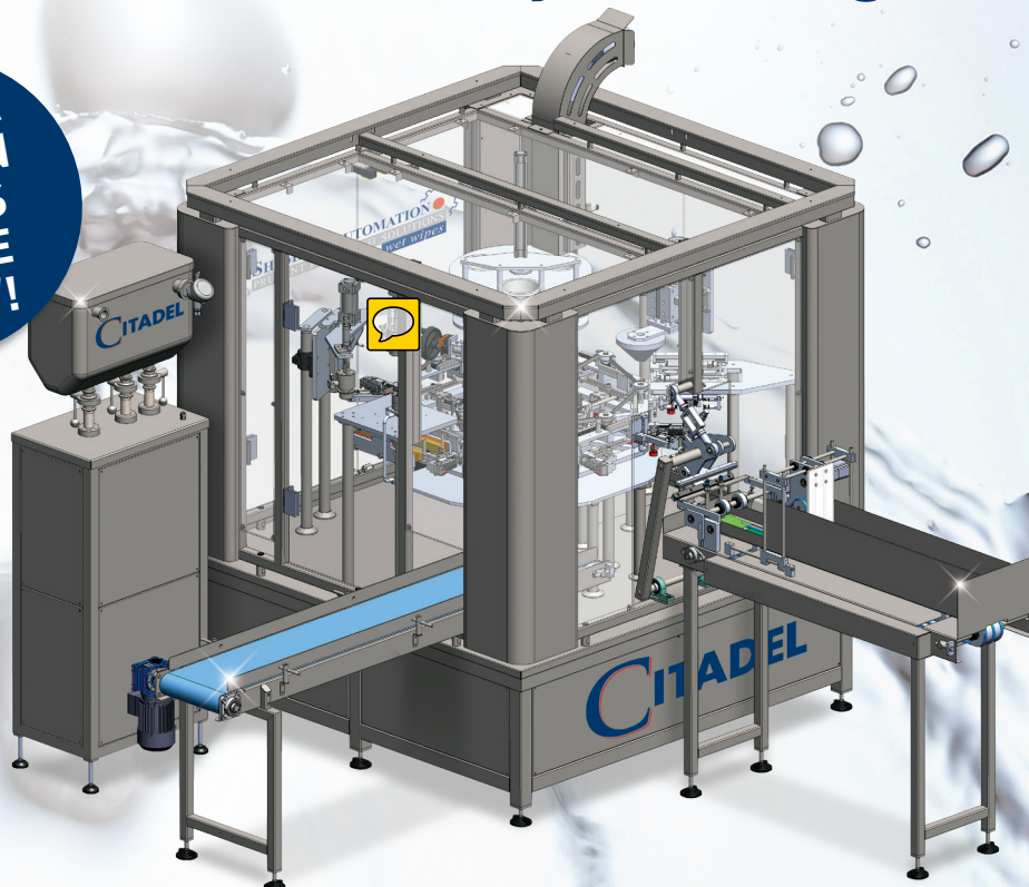
CITADEL World's first complete monoblock solution for wipes packaging in ready made bags. Fully automated bag feed, form, roll stuffing, liquid filling & bag sealing – all in one block with full QC!